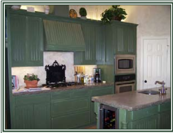
Pictures can not adequately represent this development reminiscent of European Cottages.

You may choose the model, or take advantage of this opportunity with one of our homes now in planning or under construction, and add your special choice of colors and unique design touches.